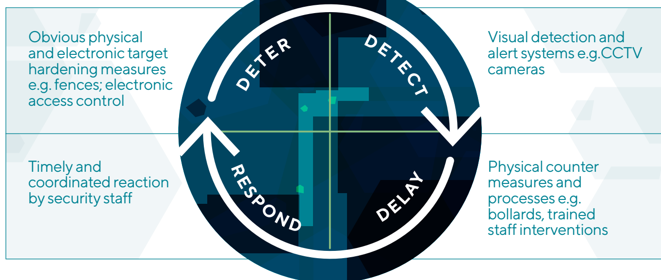
Figure 2: Layered Security

Refer to Figure 3 for examples of protective security measures in each layer that owners and operators of crowded places can use. Some security measures strengthen more than one layer. For example, security officers can help to deter, detect, delay and respond to an attack.