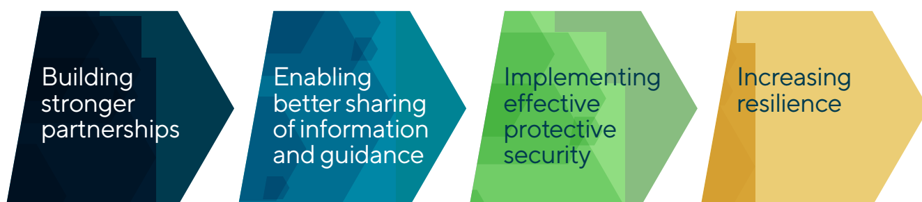
Figure 1: New Zealand's strategy for protecting crowded places

New Zealand's strategy has four elements that can be applied consistently, yet flexibly, to all crowded places (see Figure 1).